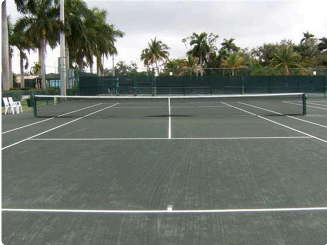
MARTY'S COURT 4